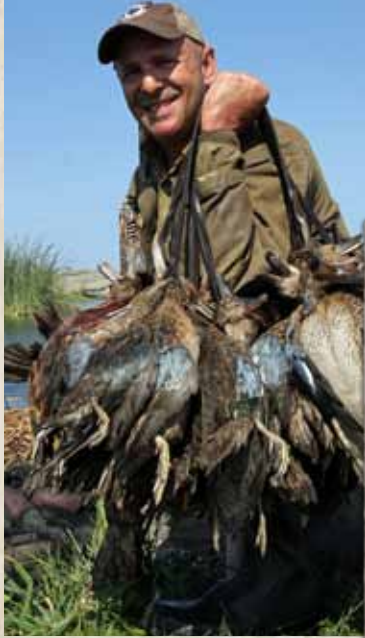
Peru Cinnamon Teal Hunt