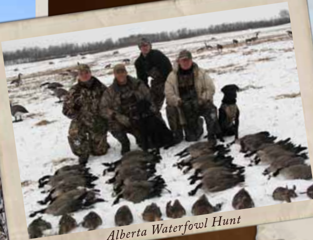
Alberta Waterfowl Hunt