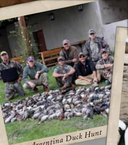
Argentina Duck Hunt