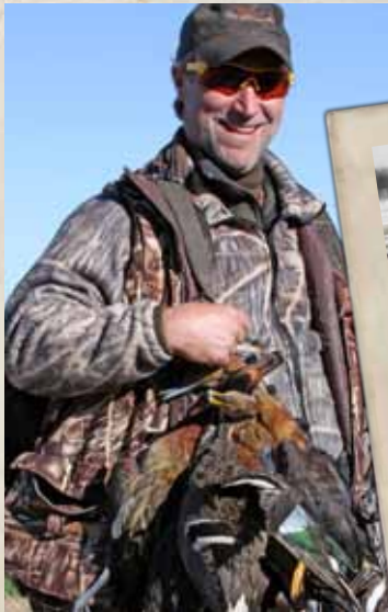
Argentina Duck Hunt