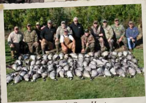
Ontario Goose Hunt