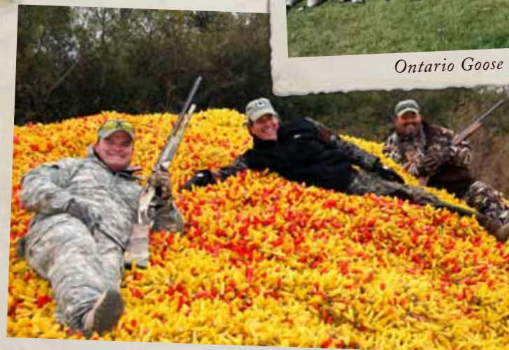
Argentina Dove Hunt