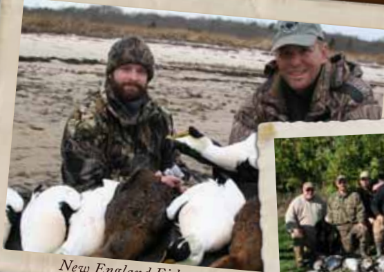
New England Eider Hunt