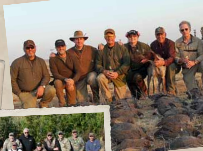
South Africa Bird Hunt