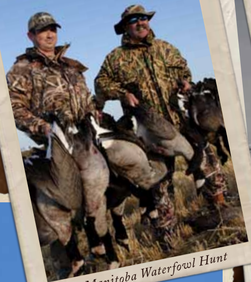
Manitoba Waterfowl Hunt

"Córdoba dove hunting is indescribable. Personal guides, more birds than one can imagine, and the opportunity to shoot until literally one doesn't want to shoot any more."