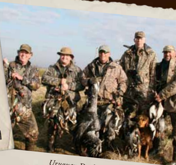
Uruguay Duck Hunt