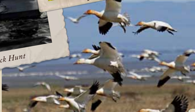
Quebec Greater Snow Geese Hunt