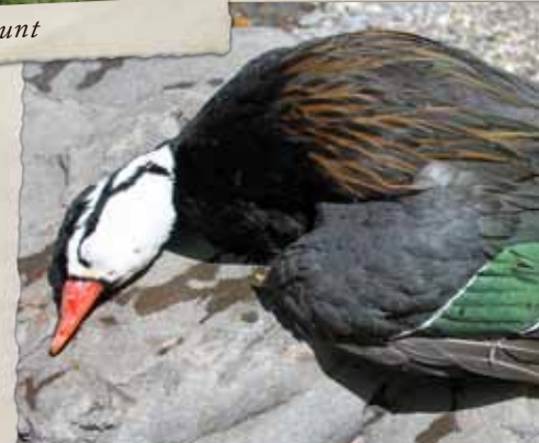
Peru Mountain Species Hunt