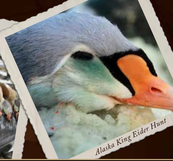
Alaska King Eider Hunt