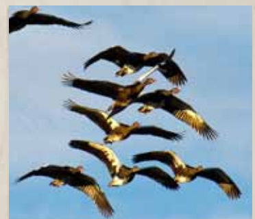
South Africa Waterfowl Hunt