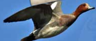
Russia Spring Duck Hunt