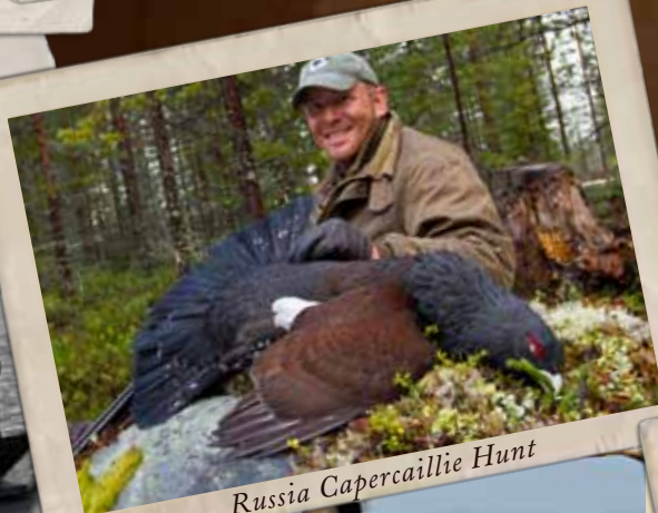
Russia Capercaillie Hunt