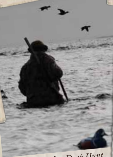
Alaska Sea Duck Hunt